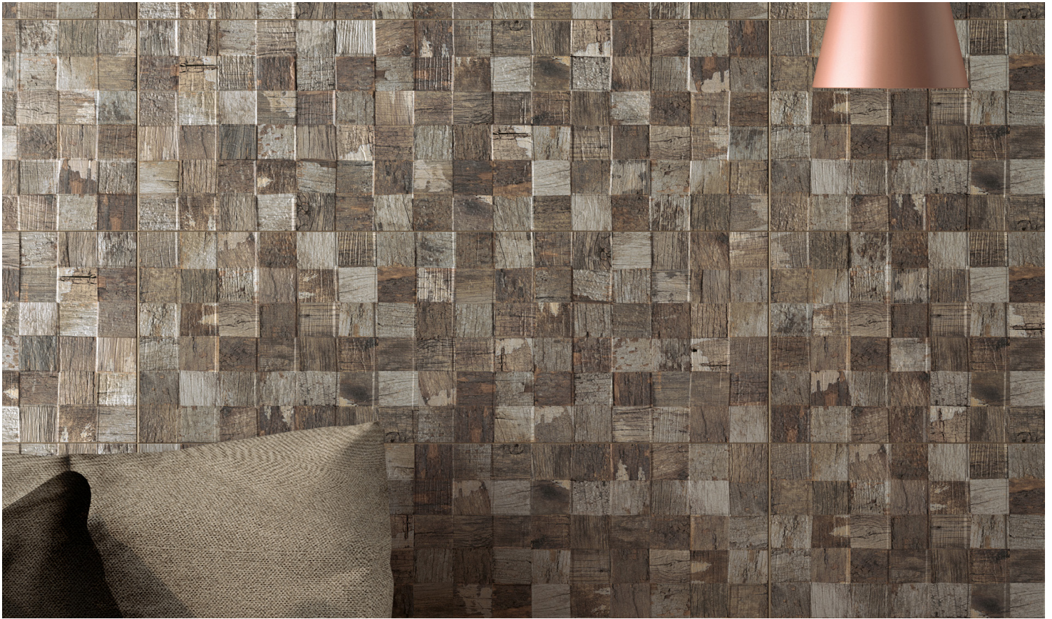
GREY/BROWN 3-D DECOR